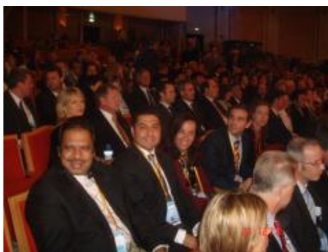
WSF with Madrid officials at the Opening Ceremony