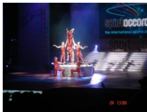
An act during the Opening Ceremony